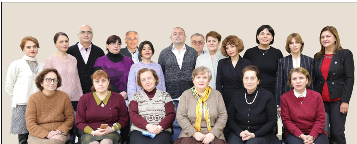
The Department of Physiology of Tbilisi State Medical University (short historical review)