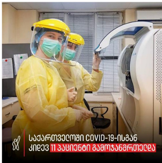
2015-2019 / 2020-2021 TSMU First University Clinic Laboratory