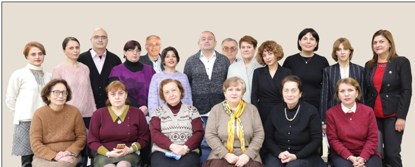
The Department of Physiology of Tbilisi State Medical University (short historical review)