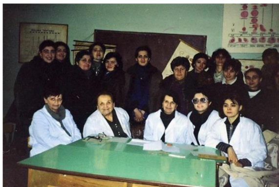
1990-2000 - Department of Clinical Diagnostic Laboratory