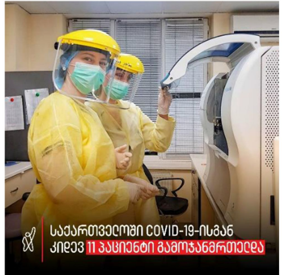
2015-2019 / 2020-2021 TSMU First University Clinic Laboratory