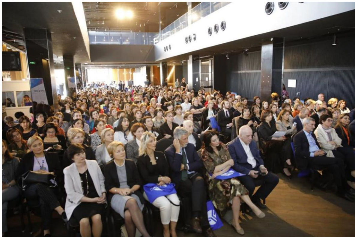
2019 - Conference held under the auspices of TSMU Department of Laboratory Medicine